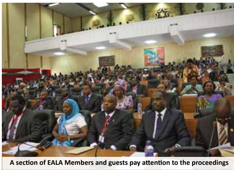
A section of EALA Members and guests pay attention to the proceedings

Change Policy was approved by the Heads of State during the 9th Extra-Ordinary Summit held in April 2011 in Dar es Salaam, Tanzania. Also developed are draft EAC Climate Change Strategy, draft operational modalities for the EAC Climate Change Master Plan and a corresponding draft Disaster Risk Reduction and Management Strategy.