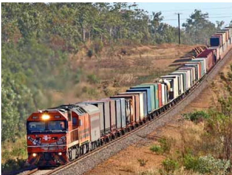
The Rail system. The share of rail transport to GDP is currently low

Now is the time for implementation, and I look forward to a review by the Heads of State every two years, of progress in EAC's critical infrastructure priority projects.