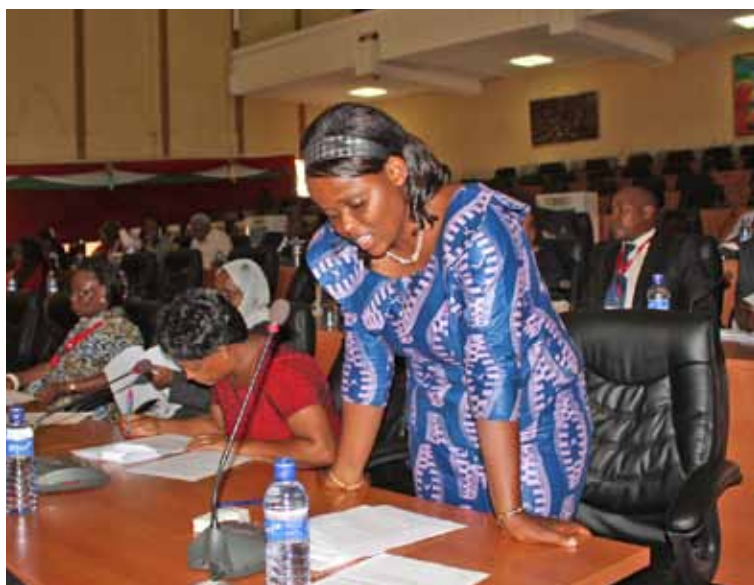
Hon Isabelle Ndahayo contributes during one of the Plenary sessions

The Chairperson of the EALA Committee on Agriculture, Tourism and Natural Resources, Hon. Isabelle Ndahayo also addressed the Workshop remarking that the Committee had embarked on the process of developing a regional legislation in the management of Natural Resources. EALA further held workshops to review on benchmarks and standards for a regional law in the sectors of Minerals and Petroleum and borrowed experiences from positive Ghana's Petroleum Legislation and the Tanzanian Mineral Law of 2010.