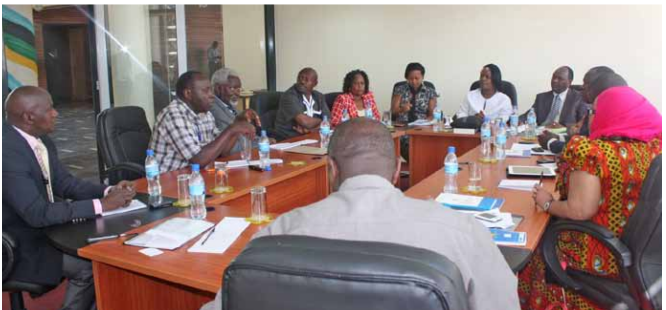
The Committee on Legal Rules and Privileges during their meeting in Arusha

The objective of the assessment was to establish if the laws above are being implemented in the EAC Partner States and if not, the reasons behind the failures.