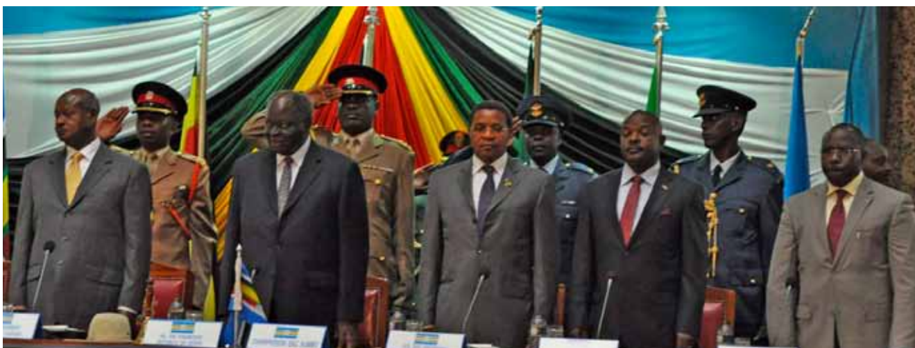
Uganda's President Yoweri Kaguta Museveni, Kenya's President Mwai Kibaki, United Republic of Tanzania's President Jakaya M. Kikwete, Burundi's President Pierre Nkurunziza and Rwanda's Prime Minister, Rt. Hon Pierre Damien Habumuremyi stand for the EAC anthem at the start of the retreat on infrastructure

To access the copy of the Communique of the 2 nd EAC Heads of State Retreat on Infrastructure, please visit the EAC website www.eac.int .