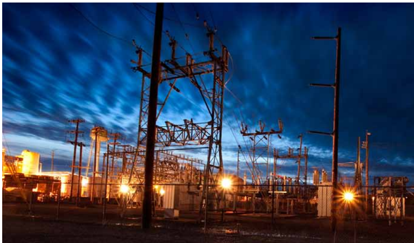
A key component of infrastructure is energy. High costs of production however dilute investors thirst for enhancing opportunities

It gives me immense pleasure to contribute an article on the 2 nd EAC Heads of State Retreat on Infrastructure Development and Financing to the 6 th edition of the Bunge La Afrika Mashariki Magazine. The Retreat was held on 28 November 2012 at the Kenyatta International Conference Centre in Nairobi, Kenya.