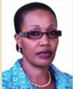
By Hon. Hafsa Mossi