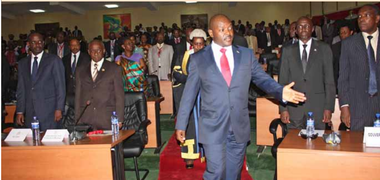
President Pierre Nkurunziza arrives at the Burundi National Assembly where he opened the 4 th Meeting of the 1 st Session of the 3 rd Assembly

...President Nkurunziza upbeat about integration