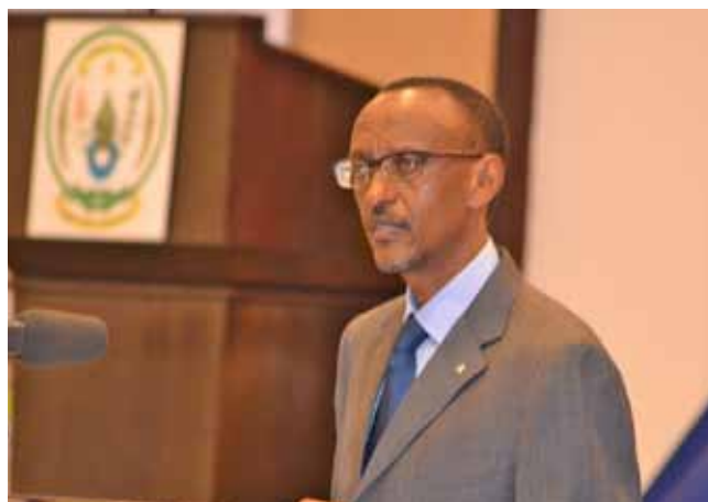
President Kagame: RPF Party has brought peace and developed the country