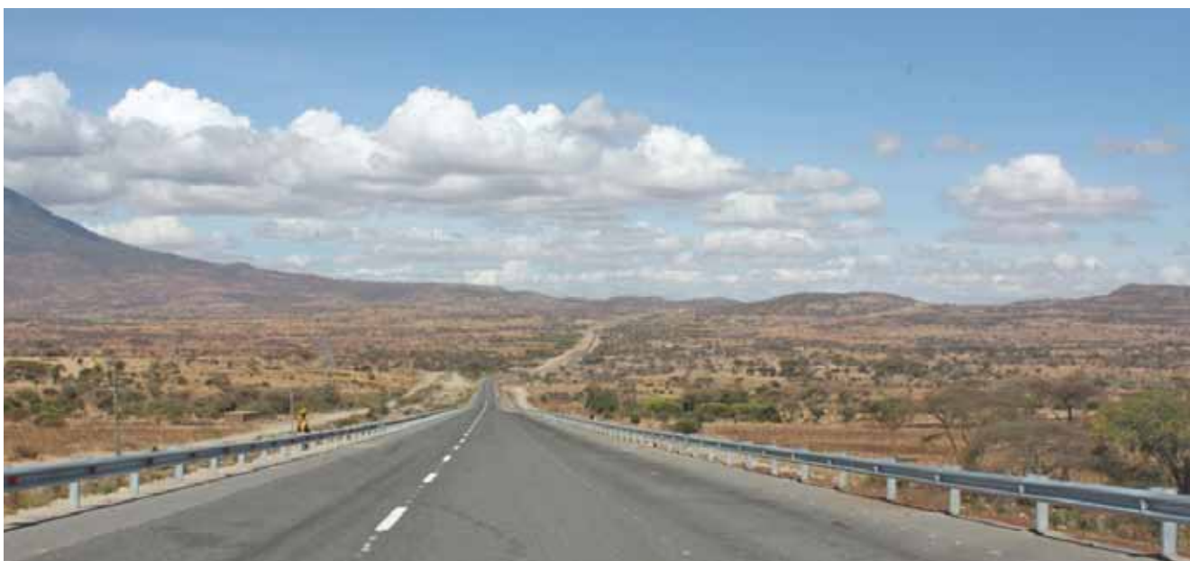
A section of the Arusha-Namanga-Athi river road. Inter-connectivity is key for economic growth of the region

Amb. Dr. Richard Sezibera is the Secretary General of the East African Community