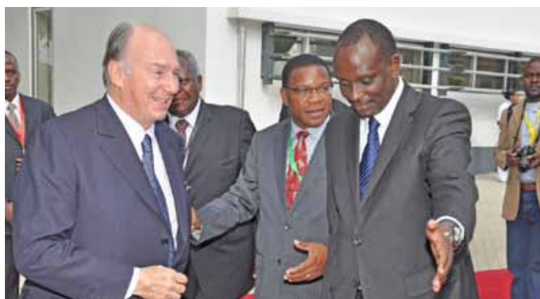
His Highness the Aga Khan is ushered in by the EAC Secretary General, Amb Dr. Richard Sezibera and the Minister for Foreign Affairs, United Republic of Tanzania Hon Bernard Membe