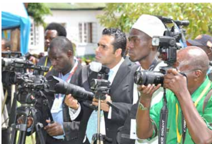
The media. They need to tell the African story in a balanced, accurate and objective way

How often, then, to appreciate President Kagame’s frustration, do the international media comprehend