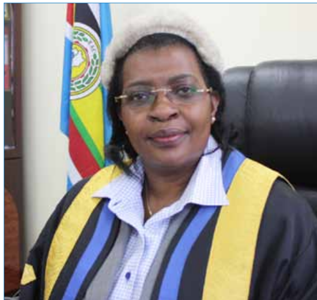
RT. HON. ZZIWA MARGARET

The stage is set for the EAC region to re-double its efforts and to anchor itself as a strong bloc in 2013. My greatest hope is to have an East African regime integrated through sharing of common ideas, policies, market and currency; with a common language and