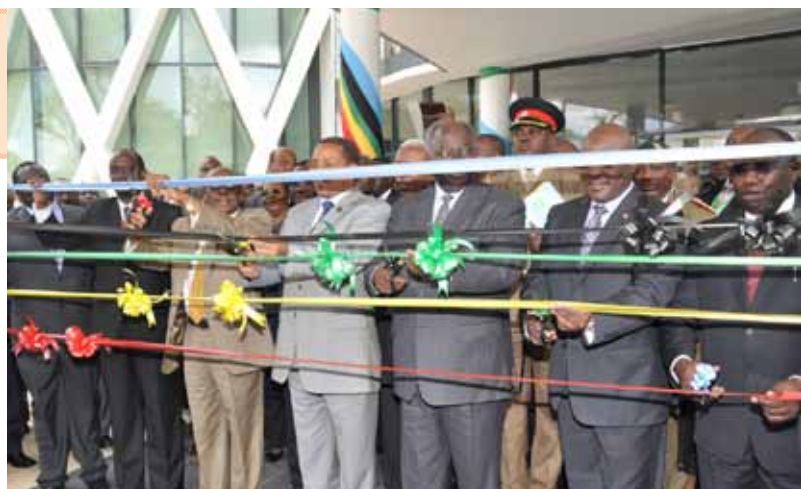
We hereby officially declare the Headquarters