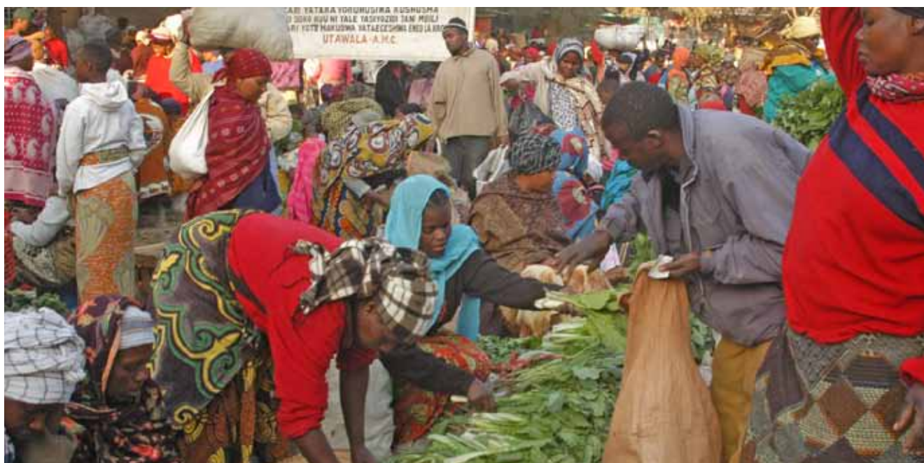
A typical market day. Agriculture is a key component of the EPAs

EALA has maintained that the EAC-Economic Partnership Agreements (EPA) process should fully take into account the regional integration agenda and ensure the agreements realised foster economic growth and development.