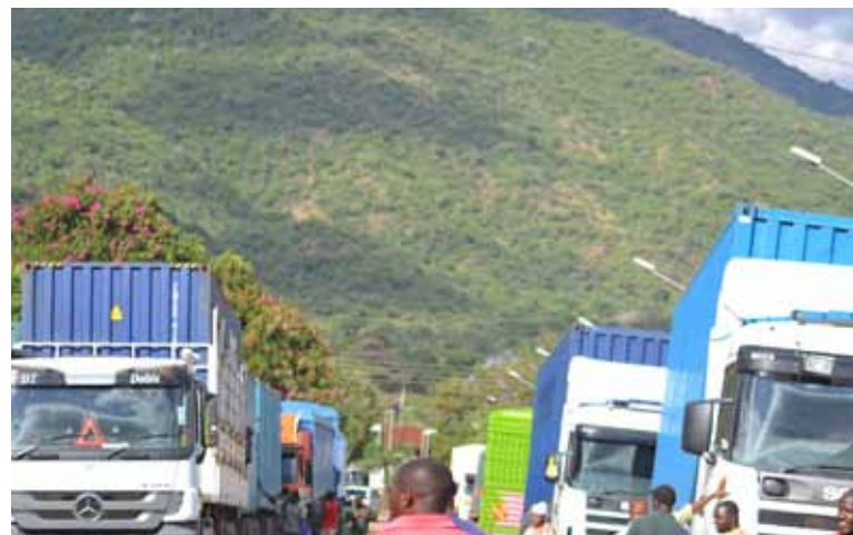
Trucks at the border point. The CTI committee undertook an assessment of the northern and central corridor to assess gauge the state of Non-Tariff Barriers in the region

The Joint Observer Mission made its assessment of the electoral process on the basis of the information gathered during meetings with relevant stakeholders and observation of the process. The Committee