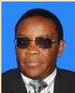
By Hon. Pierre Celestin Rwigema