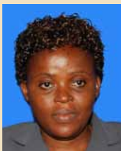
By Hon. Isabelle Ndahayo