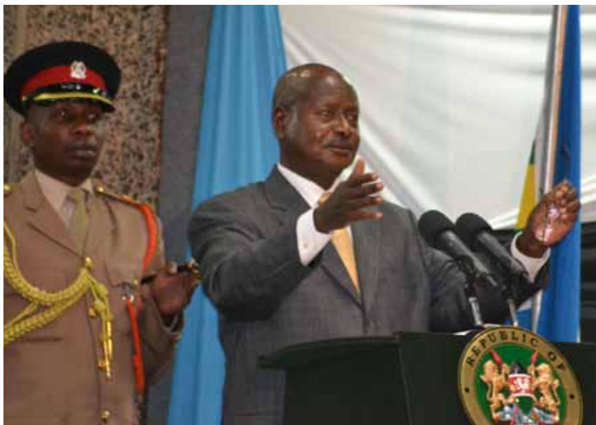
President Museveni delivers his speech

noted with appreciation that there has been steady progress in the integration process of the region. According to the Communiqué, the leaders approved a health initiative to improve maternal and child health and also acknowledged the progress on the road towards regional political federation.