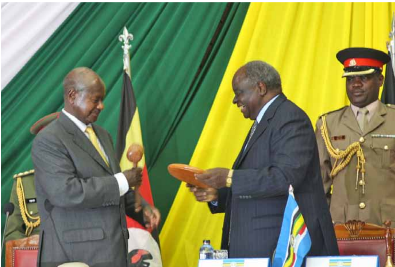
President Mwai Kibaki presents the instruments of power to the new Chair of the Summit, President Yoweri Museveni in Nairobi

President Yoweri Museveni assumed the Chair of the EAC as the one-day 14th Ordinary Summit of the East African Community (EAC) Heads of State and Government took place in Nairobi on November 30, 2012.