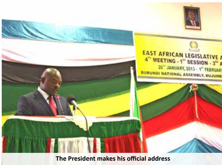
The President makes his official address

With it also comes the call for the establishment of a Regional Climate Change Parliamentarians Forum to enhance the understanding on issues related to Climate Change and to network with National Parliaments. The EAC has over the last few years realized some key achievements. The EAC Climate