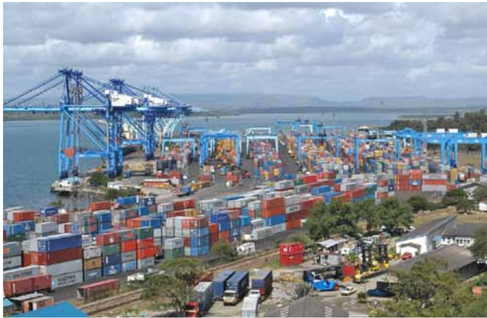
The port. It is important for the region to look for markets for its raw materials

On his part, Hon Abubakar Zein Abubakar said it was vital for stakeholders such as the Private Sector and Civil Society to be involved in the process. The legislator invited the EAC to make use of the political arena noting that EALA was capable of lobbying with