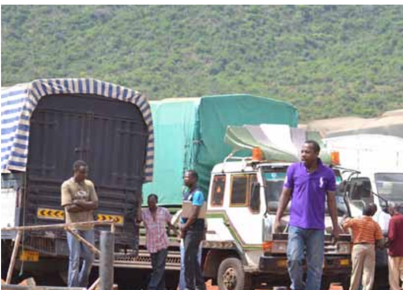
Trucks wait to be off-loaded. The region needs to enhance its infrastructure so as to address supply constraints

“We must be very cautious and focused. We should be looking at areas where we have comparative advantage so that we compete favourably on the world market – calling for investments in natural resources”, the Minister remarked.