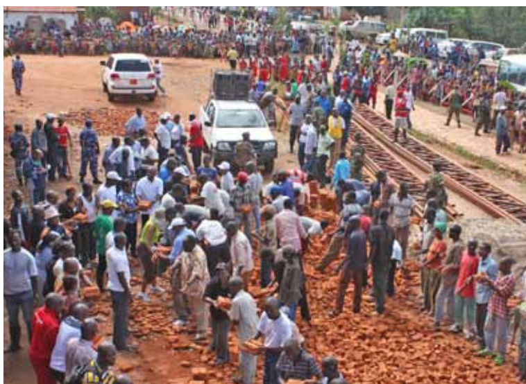
The multitude of residents who turned up for the Community works

Please see Interview with H.E. Pierre Nkurunziza on opposite page.