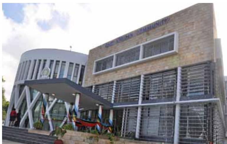
The magnificent home that is the EAC

The complex has three elements, the Plenary tower which contains the plenary hall of the Assembly, three storey wings connected by a lobby that accommodate