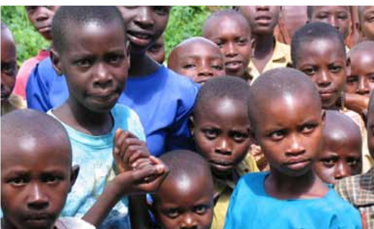
Many children were left orphaned by the Genocide Against the Tutsi

It is devastating that it only took 100 days to destroy an entire nation and to destabilise its economy. The