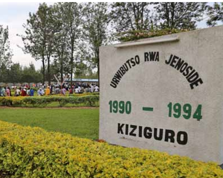
Kiziguro Genocide Memorial Site where thousands of Tutsi who were killed at Kiziguro parish are buried

Hutu and Tutsi became the defining attributes of the Rwandan race. In the absence of ubunyarwanda , (the Rwandan ideology), the political class in their effort to solidify power used Hutu and Tutsi relations to explain why one should prevail over the other. This changed the Rwandan Psychic. Belgian colonialists believed Tutsi were naturally superior as descendants from the Israelite tribe of Ham. Belgians distinguished between Hutu and Tutsi by nose size, height and eye type. Another indicator to distinguish Hutu farmers from Tutsi pastoralists was by the number of cattle owned.