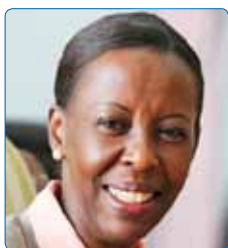
By Hon Louise Mushikiwabo