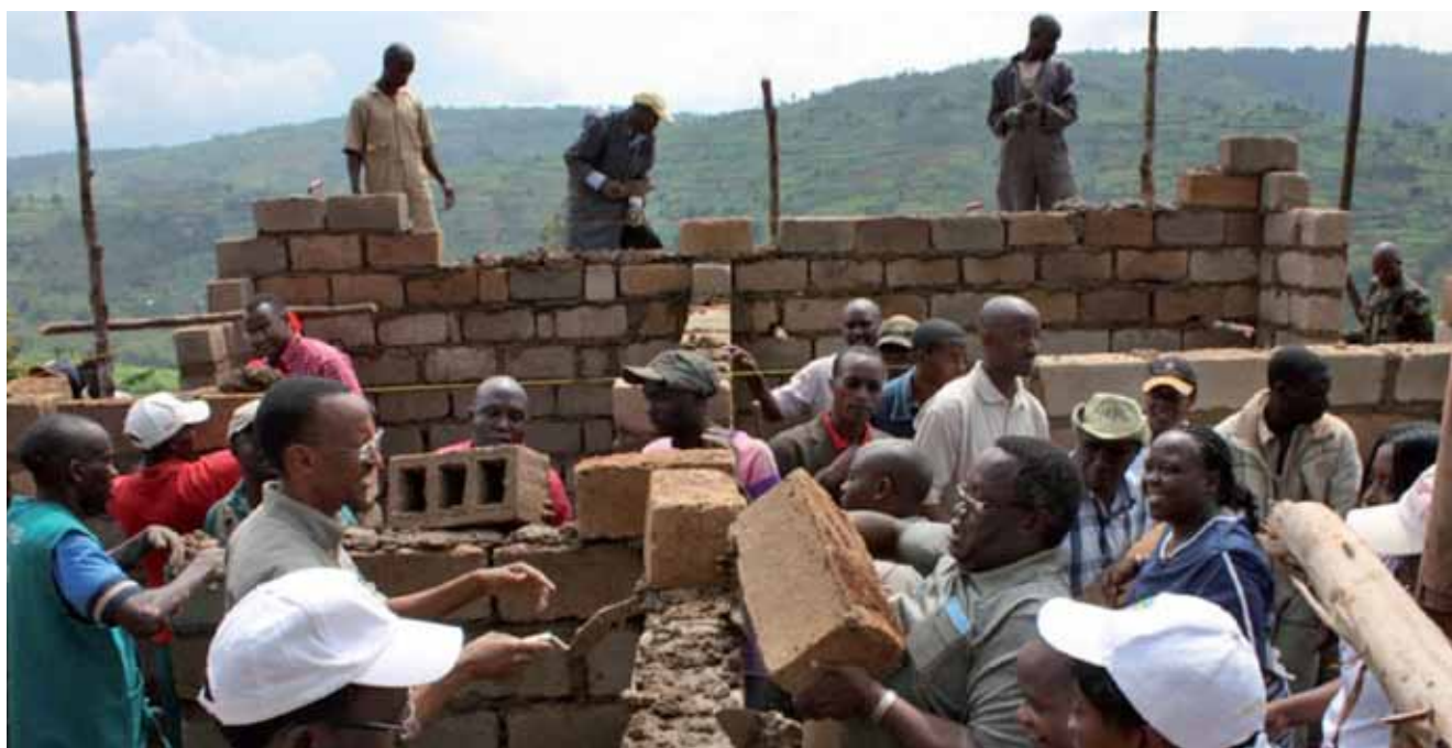
President Paul Kagame joins members of the 2 nd EALA in building houses during the Anti-Nyakatsi campaign in April 2011

in the anti-Nyakatsi drive in Kanyinya area where President Paul Kagame joined the Members in building the houses.