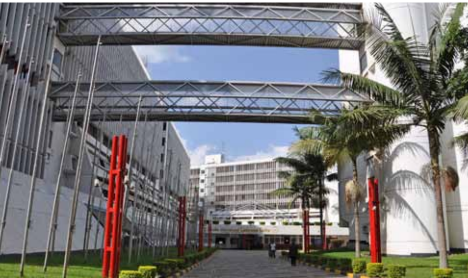
AICC Building where the ICTR is based