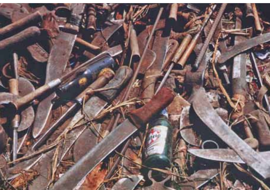
A cache of crude weapons used during the Genocide Against the Tutsi

Rwanda was my first international assignment as the then Foreign Correspondent for the East African Standard newspapers. It was an exciting and fulfilling journalistic expedition that would later take me through the whole breath of the so-called African conflict zones between Mogadishu, Maputo and Monrovia. But nothing came close to