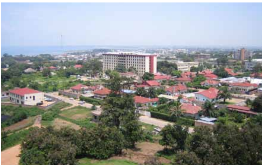
A birds’ eye view of Bujumbura. Burundi narrowly escaped the explosion that imploded next door

In June 1994, for instance, at the height of the Rwandan genocide, more than 100 Tutsis were reportedly slaughtered and the army responded by killing many more Hutu tribesmen. And to show that they it had no or little regard to the Hutus next door, some of whom have fled to Burundi in search of an elusive asylum, Burundi’s security forces were