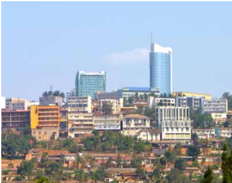
The Kigali skyline. Rwanda has made great strides in development since 1994

was adopted by the UN General Assembly on 9th December 1948, and that it came into effect two years later.