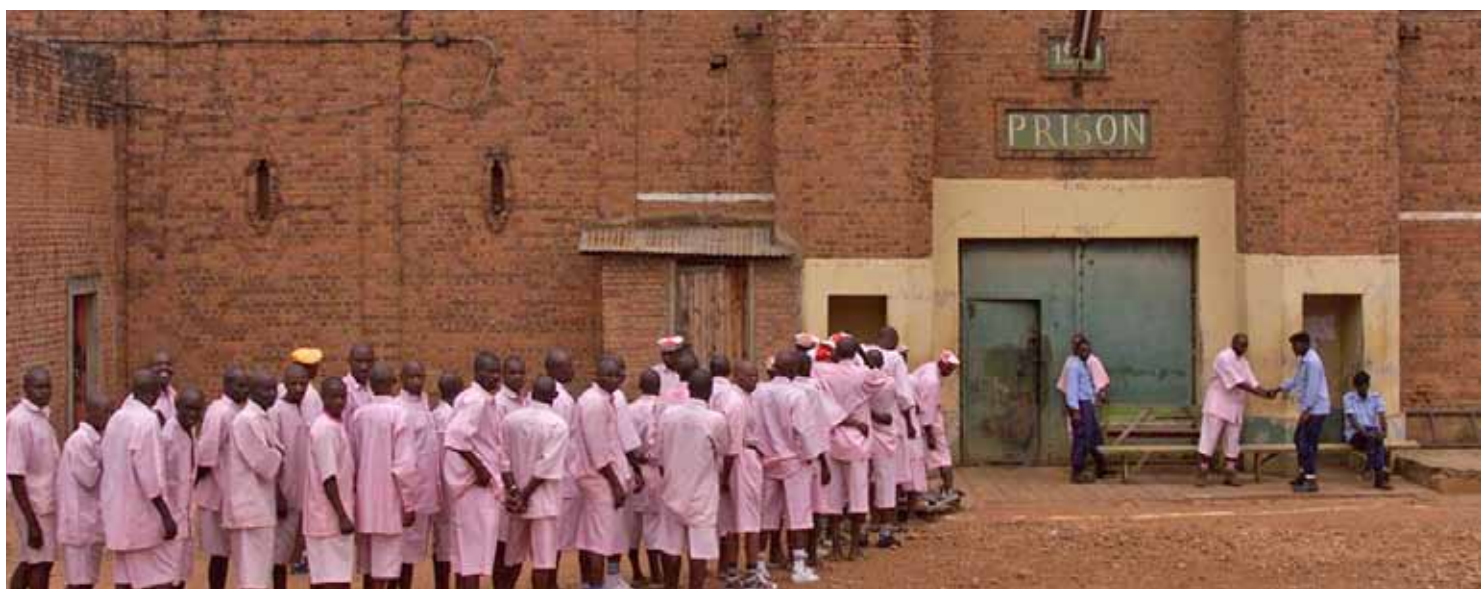
People suspected of involvement in Rwanda's 1994 genocide line up before re-entering Kigali's central prison from a day at work in the fields

Some of ICTR's judgments are today an indisputable proof of the Tribunals' tangible contribution to the fight against impunity.