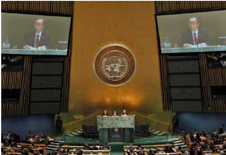
EALA admonished the United Nations for doing too little – too late, to stop the 1994 Genocide Against the Tutsi