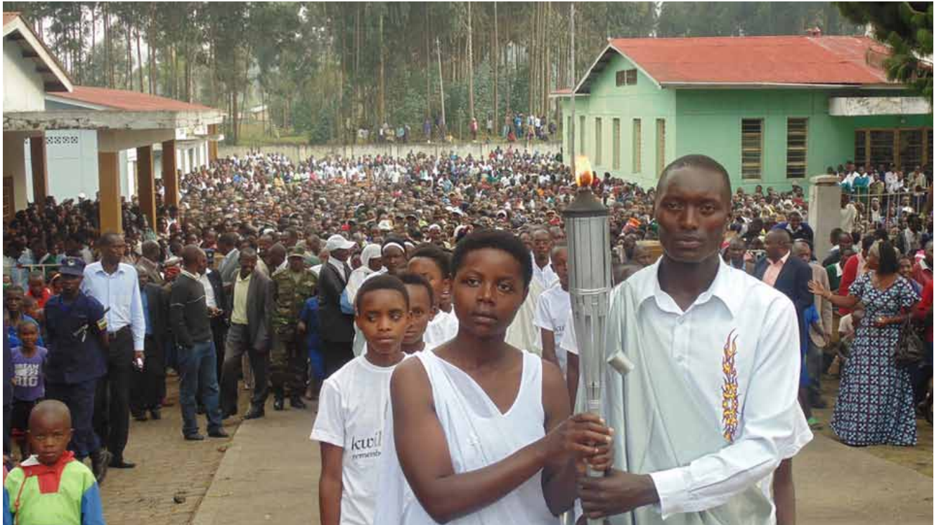
Kwibuka Flame symbolises remembrance as well as the resilience and courage of Rwandans over the past twenty years of the genocide against the Tutsi