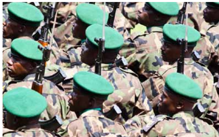
THE ARMY AT CALL: the region needs to ratify the Protocol on Peace and Security

So far, two Partner States – Uganda and Rwanda have appended their signatures to ratify the Protocol while the other three, Burundi, Kenya and the United Republic of Tanzania are at various stages in the process of ratification.