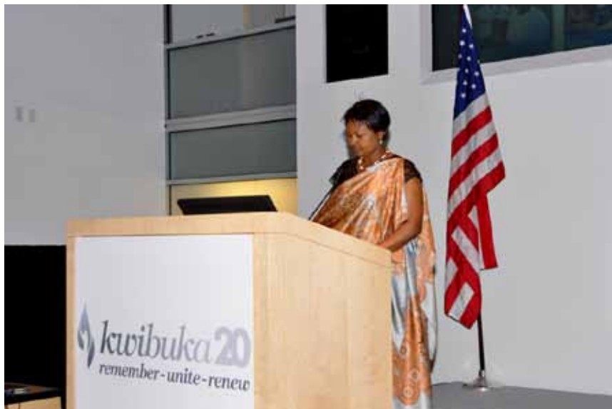
Kwibuka20 Launch, New York, USA: February 27, 2014

EALA on its part has dedicated its entire quarterly publication, Bunge la Afrika Mashariki to the worthy course. The Assembly which has continued to support Rwanda is sending a very strong message that Never Again should genocide be repeated in Rwanda or anywhere else in the region, continent and globe. 🇷🇼