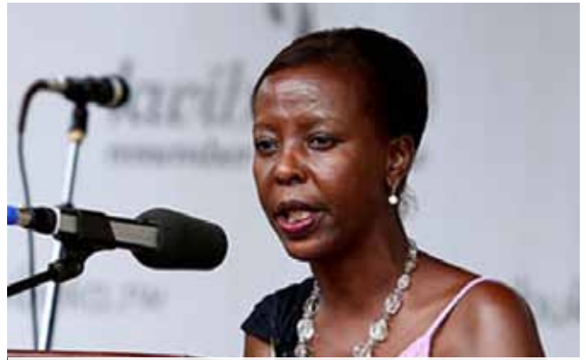
Louise Mushikiwabo, Minister of Foreign Affairs and Co-operation, Government of Rwanda during the Launch of Kwibuka20 Kigali Genocide Memorial Centre, 7 January 2014

In return, we ask that Rwandans embrace the opportunities on offer. We urge that they participate