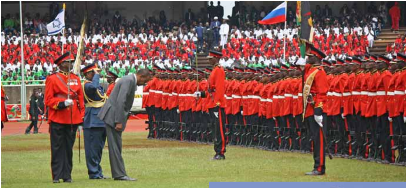
The Head of State takes a bow

President Kenyatta reiterated the Unity of Kenyans and their commitment to Peace and Development given the new Constitutional Order.