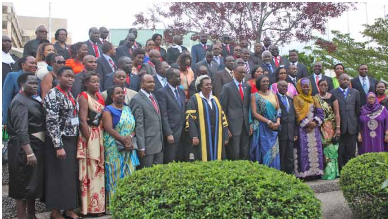
President Paul Kagame and EALA Members pose for a photo during one of the Plenary Sitzings

In April 2013 when President Paul Kagame last addressed EALA at the opening of the 5th Meeting of the 1st Session, he made one thing clear that, the consequences of bad politics and leadership are tragic in any society.