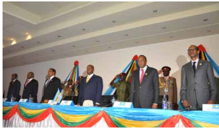
The Heads of State. Leadership is key for peace and development

“I am of the view that the Peace and Security Sector in the EAC should be dynamic in order to respond to the nature and form of the ever evolving security threats, crime types and trends owing to advancement in technology, information dissemination and globalization”, she said.