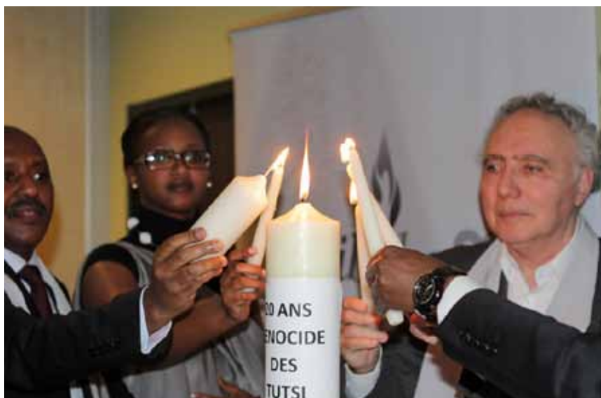
Kwibuka20 Launch, Lyon, France: February 26, 2014