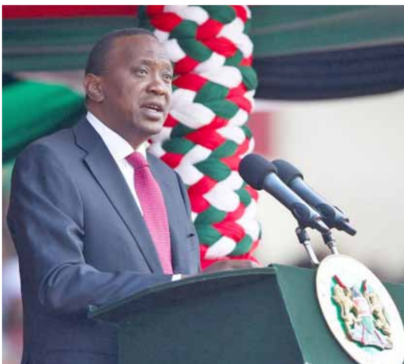
President Uhuru Kenyatta addresses the country on Jamhuri day

It was a wet morning on 12 December 2013, when vivid memories of a fully grown Nation were rekindled in our minds and hearts. At the time, the country was stamping on the ground firmly with a new constitutional dispensation! Kenya boasted of a newly elected government! With it, came vibrant devolved powers to new County Assemblies.