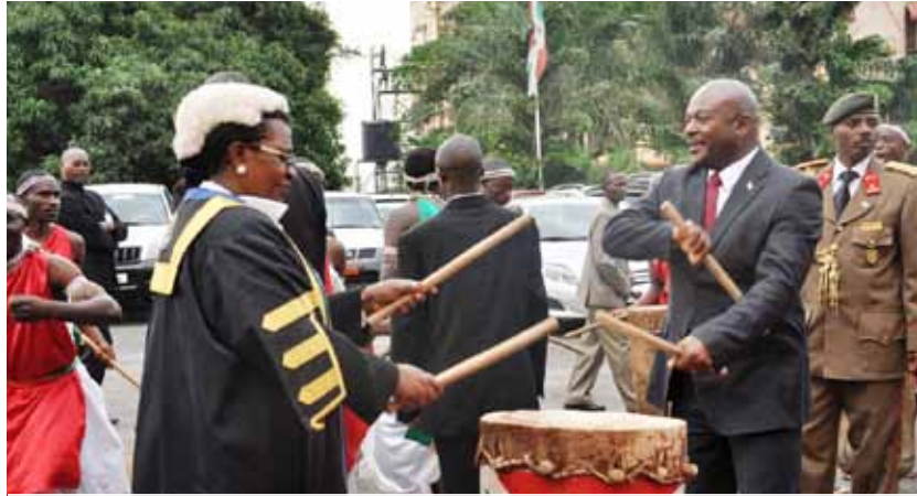
President Pierre Nkurunziza and the EALA Speaker, Rt. Hon Margaret Nantongo Zziwa sample the talking drums of Burundi. Today, Burundi under President Pierre Nkurunziza is a thriving democratic nation that is at peace with itself

The army ruler had little regard for the Hutus and coupled with the overthrow of then King Ntare, not only ended centuries-old institution but directly led to an upsurge of pogroms against the Hutus. During his rule, there were many reports of killings, but given the international climate at the time, not many questions were asked. Micombero was in turn overthrown by Colonel Jean Baptiste Bagaza who could not be considered an extremist like his predecessor but was