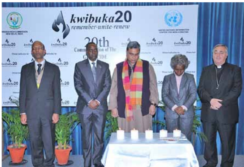
Kwibuka20 Launch, New Delhi, India: January 31, 2014