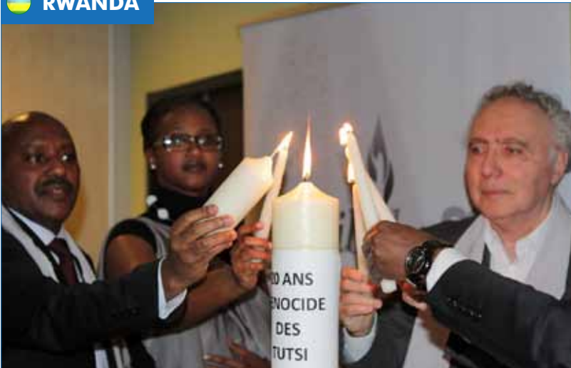
Commemoration of 20 th Anniversary of the Genocide against the Tutsi