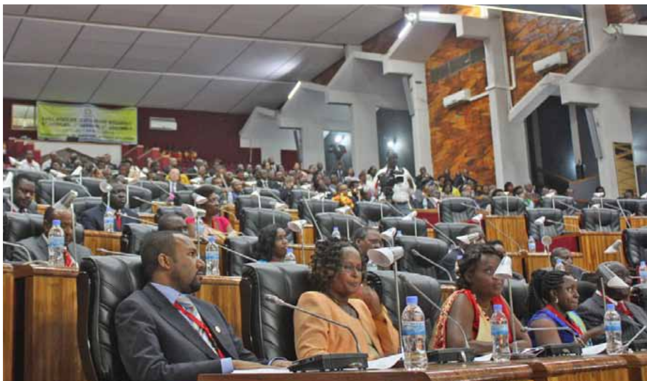
A section of EALA Members during a past Plenary in Kigali, Rwanda

“The Assembly has also approved the formation of a Select Committee to study and to make recommendations to the House on the likely security impact of genocide ideology to the region.”