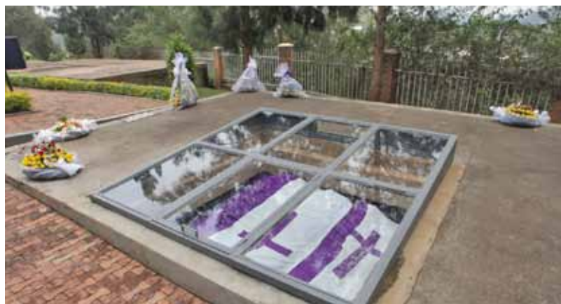
However painful, Rwanda is bound by its history, but the citizens bound NEVER to repeat it

In light of this history, Rwanda has become synonymous with a certain kind of preventable