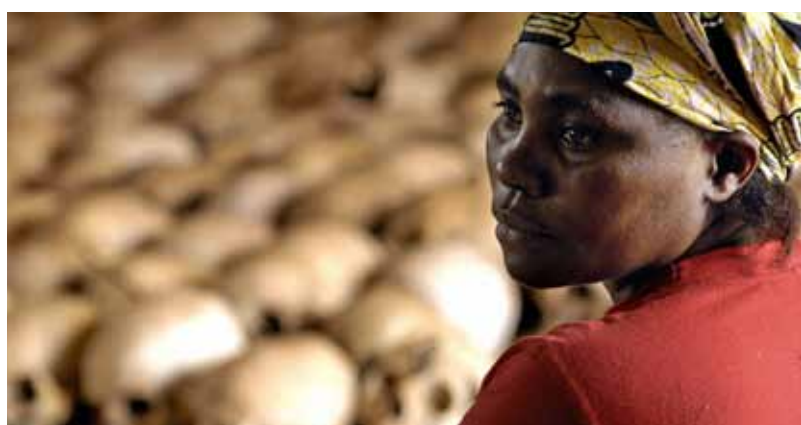
It is by remembering and honouring the lives that Rwanda lost, that we express solidarity with those who survived

atrocities. World leaders and editorial writers routinely profess determination that “another Rwanda” must never occur again, whether in the Central African Republic, South Sudan or Syria.