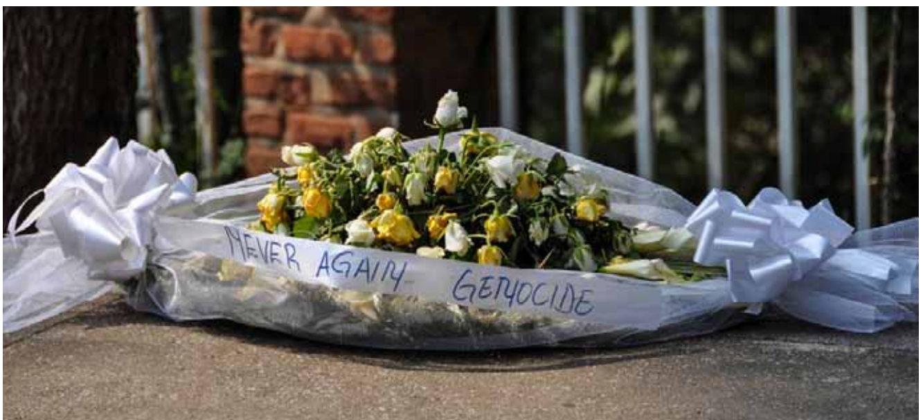
STOP GENOCIDE FOREVER: The wreath tells the story

Before I close, I call upon the EAC citizens to join their hands with Rwandans in commemorating the 20 th Anniversary of the Genocide against the Tutsi. 🇷🇼