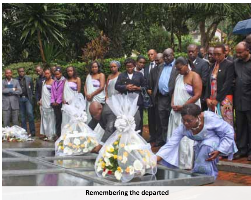
Remembering the departed