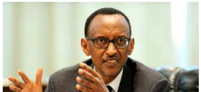
President Paul Kagame and President Yoweri Museveni attended Ntare School