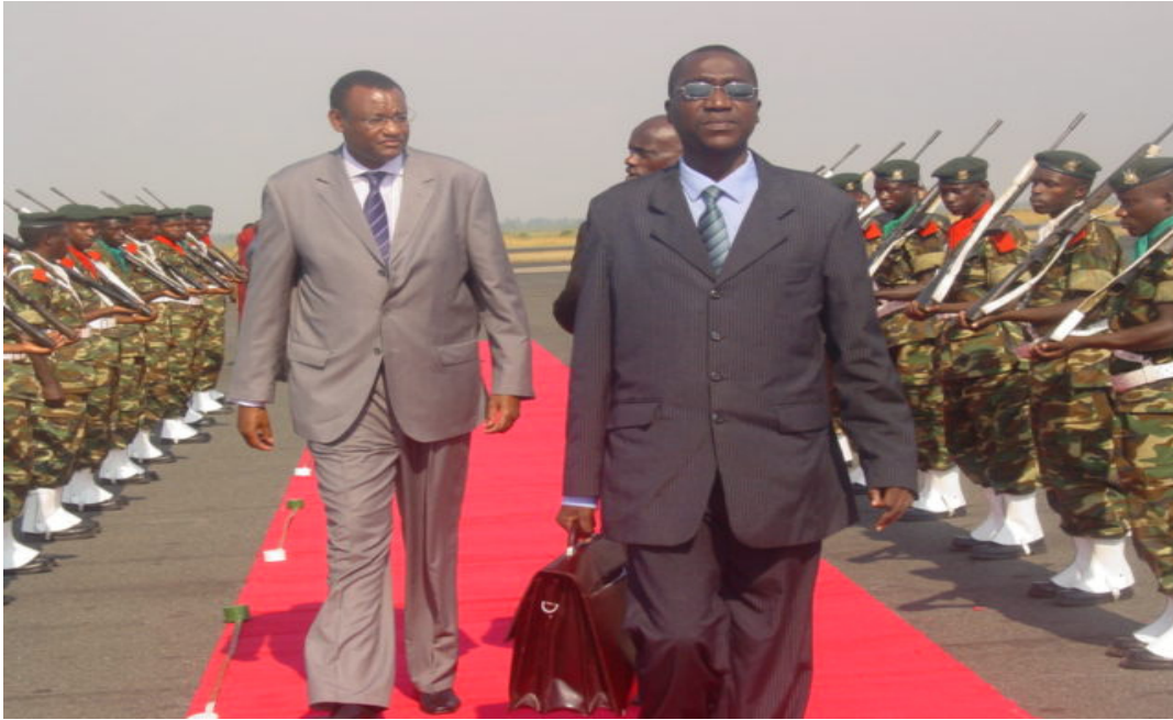
EALA Speaker, Hon. Abdirahin H. Abdi inspecting a guard of honour by the Burundi Army immediately after stepping on the red carpet at the Bujumbura International Airport during his delegation tour to the Country from August 26 - 29, 2007.