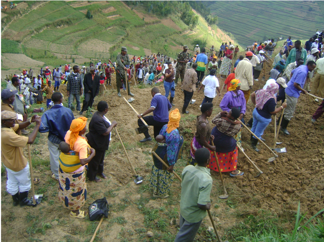
ELA Speaker and legislators participating in communal work, 'Omuganda' with the common 'wananchi' during the Rwanda tour