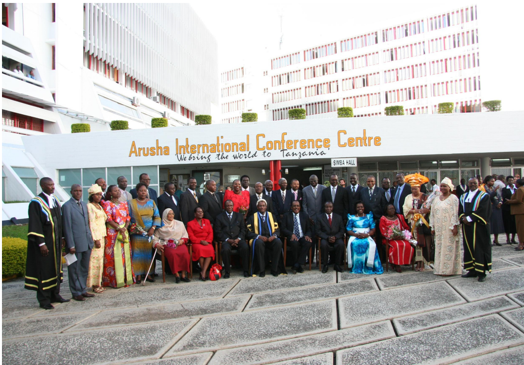
EALA Speaker in a group photo with newly sworn in Members of the Second Assembly from the three original Partner States of Kenya, Tanzania and Uganda

The East African Legislative Assembly is the legislative organ of the East African Community, and it was inaugurated on 30 November 2001. By the provisions of Article 48 of the Treaty for the Establishment of the EAC (1999), the Membership of the EALA comprises fifty two members: forty five elected by the National Assemblies of Partner States and the other five are one member responsible for Ministry of EAC Affairs from each Partner State, the Secretary General of the EAC and the Counsel to the Community.