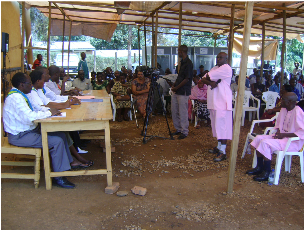
EALA legislators attended one of the Gacaca proceedings of suspects of the 1994 genocide in Nyamirambo in the outskirts of Kigali Town in September 2008