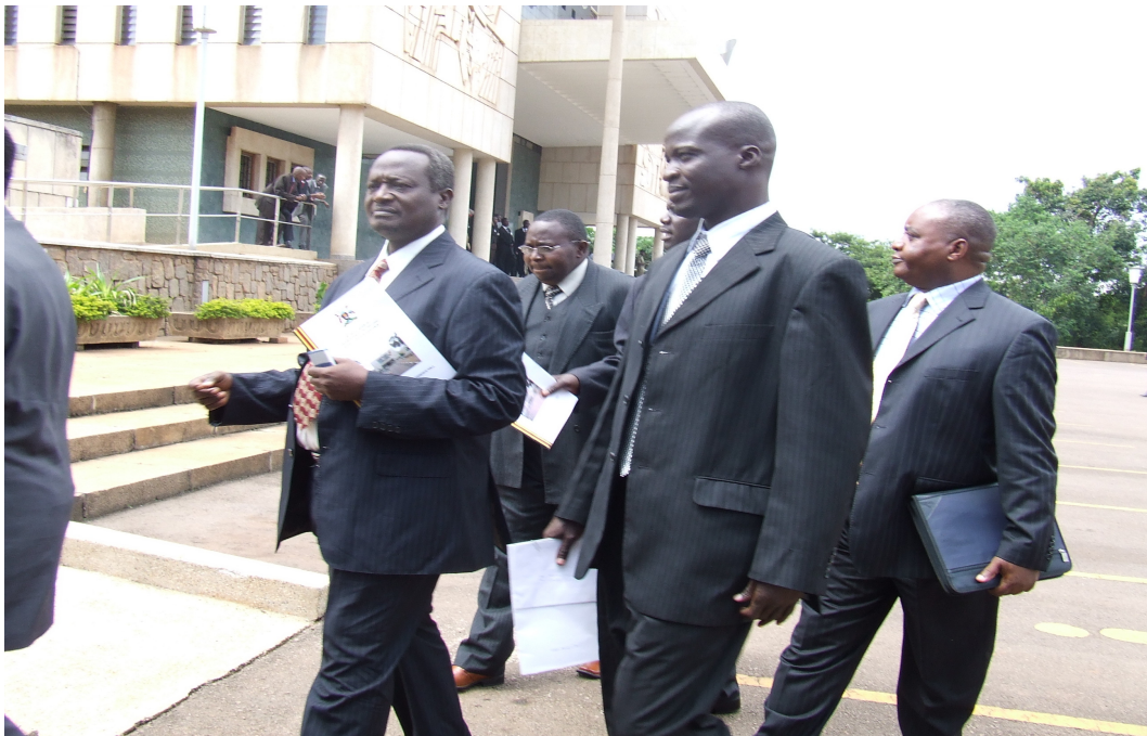
EALA legislators arrive at the Uganda National Parliament to consider, debate and approve the EAC Budget 2007/08.

EALA carried out these functions through Bills, Motions for Resolutions, Questions to the EAC Council of Ministers and Reports of Committees.