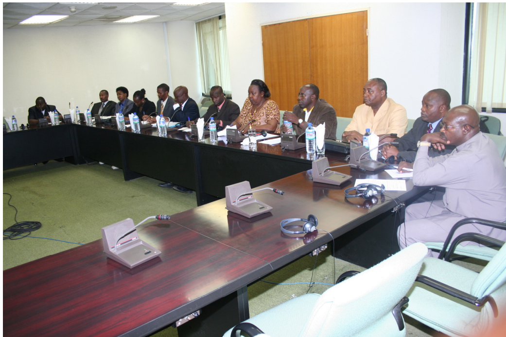
Members of the Committee on Regional Affairs and Conflict Resolution listening attentively to the President of the ECOWAS Commission, not in picture during their visit to the ECOWAS headquarters in Abuja, Nigeria from 10 th – 14 th May 2009